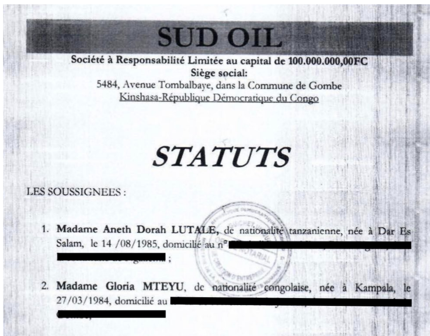
Figure 1. Excerpt of Sud Oil statutes after the transfer of ownership to members of the Kabila family.