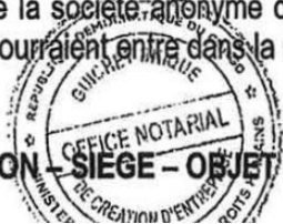
Figure 2. Excerpt from the Kwanza Capital statutes.

In 2015, Kwanza bought a 60% share in Sotexki, a textile company based in Kisangani that used to be one of the largest producers of textiles in the country. It provided a $2.4 million loan to help restart the company, which had at one point employed 2,500 people. From its inception, Kwanza Capital had also shown interest in becoming a majority shareholder of the Banque commerciale du Congo (BCDC), the second largest bank in the DRC in terms of its balance sheet and shareholder equity, notably by attempting in 2015 to buy the shares of the Forrest family, which owned 66% of BCDC. 17 According to a confidential report by the government of the United Kingdom on the financial sector in the DRC, the negotiations failed for two reasons. First, Kwanza Capital's offer of $43 million fell far short of the Forrest family's expectation of $75 million. Second, the family was unsure about the source of the funds. 18